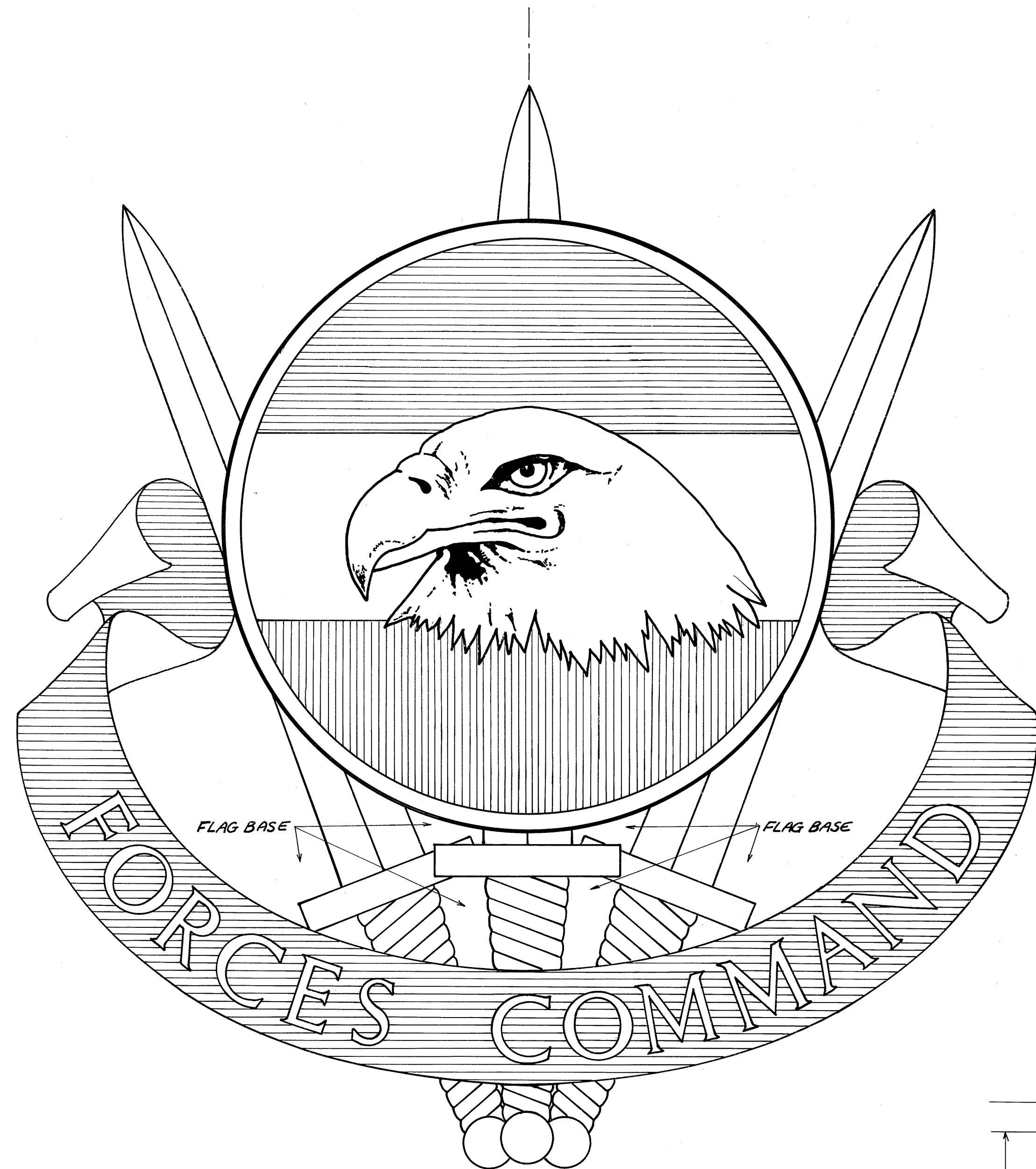
DEVICE 1/2 ACTUAL SIZE

FLAG BASE --- BLEACHED WHITE --- 80001 FRINGE --- YELLOW --- 65002 DEVICE SWORDS, BORDER OF DISC, EAGLE'S --- YELLOW --- 65002 HEAD, LETTERS & REVERSE OF SCROLL DETAILS OF EAGLE'S HEAD --- GOLD BROWN HCT --- 67194 DISC TOP STRIPE --- ULTRAMARINE BLUE --- 65010 CENTER STRIPE --- WHITE --- 65005 BOTTOM STRIPE --- SCARLET --- 65006 SCROLL --- ULTRAMARINE BLUE --- 65010